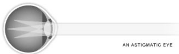
DIAGRAM 3: ASTIGMATIC EYE

Light focuses at different points in front of the retina. Vision is blurred.