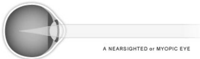
DIAGRAM 2: NEARSIGHTED EYE

Light focuses in front of the retina. Vision is blurred.